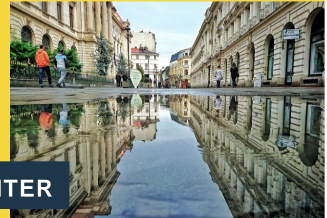
OLD CITY CENTER